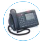
Nortel M3820, M3310 M3900 series (M3901, M3902) M3900 series (M3903, M3904, M3905) M2250 attendant console