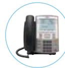
Nortel IP Phone 1110 IP Phone 1120E IP Phone 1140E IP Phone 1150E