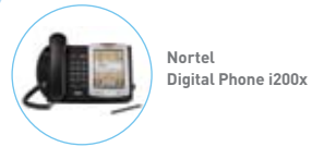
Nortel Digital Phone i200x