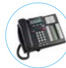
Nortel T7100 T7208 T7406 T7316